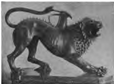
Fig. 75. Chimæra.

falsely accused him to her husband. Fearing divine anger if he himself killed a guest, Prœtus sent him to the king of Lycia, and with him a secret message asking to have him slain. The king of Lycia at first treated Bellerophon with generous hospitality, but when he had read the message he sent him off on the dangerous ad-